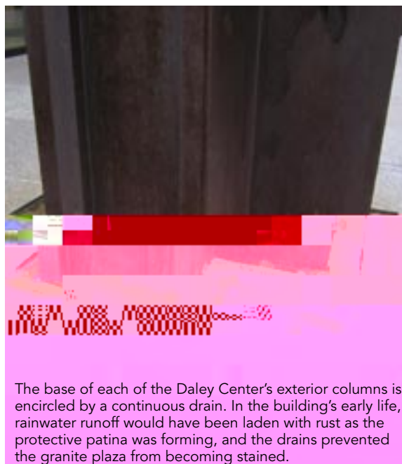
The base of each of the Daley Center's exterior columns is encircled by a continuous drain. In the building's early life, rainwater runoff would have been laden with rust as the protective patina was forming, and the drains prevented the granite plaza from becoming stained.

In the 1960s, the novelty of weathering steel (and its then-new 50 ksi yield stress) led to its application in